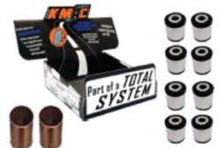
Rear "uprated" bushings for the '6' "multi link" arms