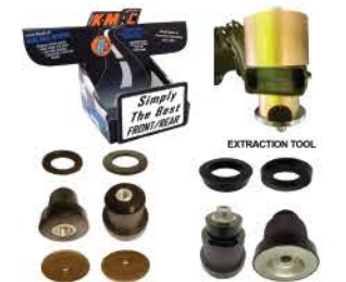
Rear subframe bushes

Resolve Costly, Premature Edge Tire Wear